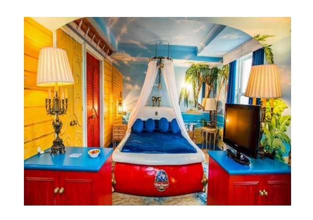
Splish Splash Room