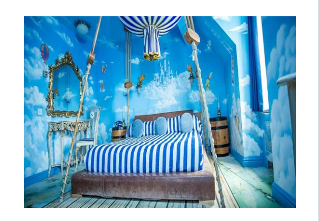
Big Pyjama Room