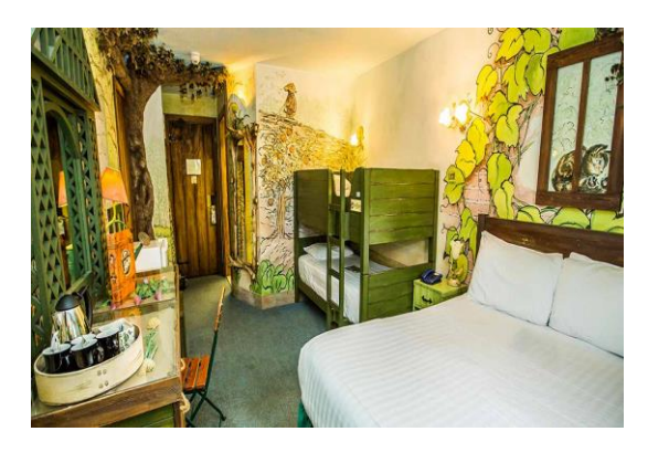
Benjamin Bunny Room

Alton Towers Hotel have a vast selection of Themed Rooms, so if Peter is not for your family, please tell us. There are some exceptional others to choose from