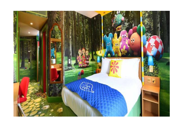
A Night in The Garden Room