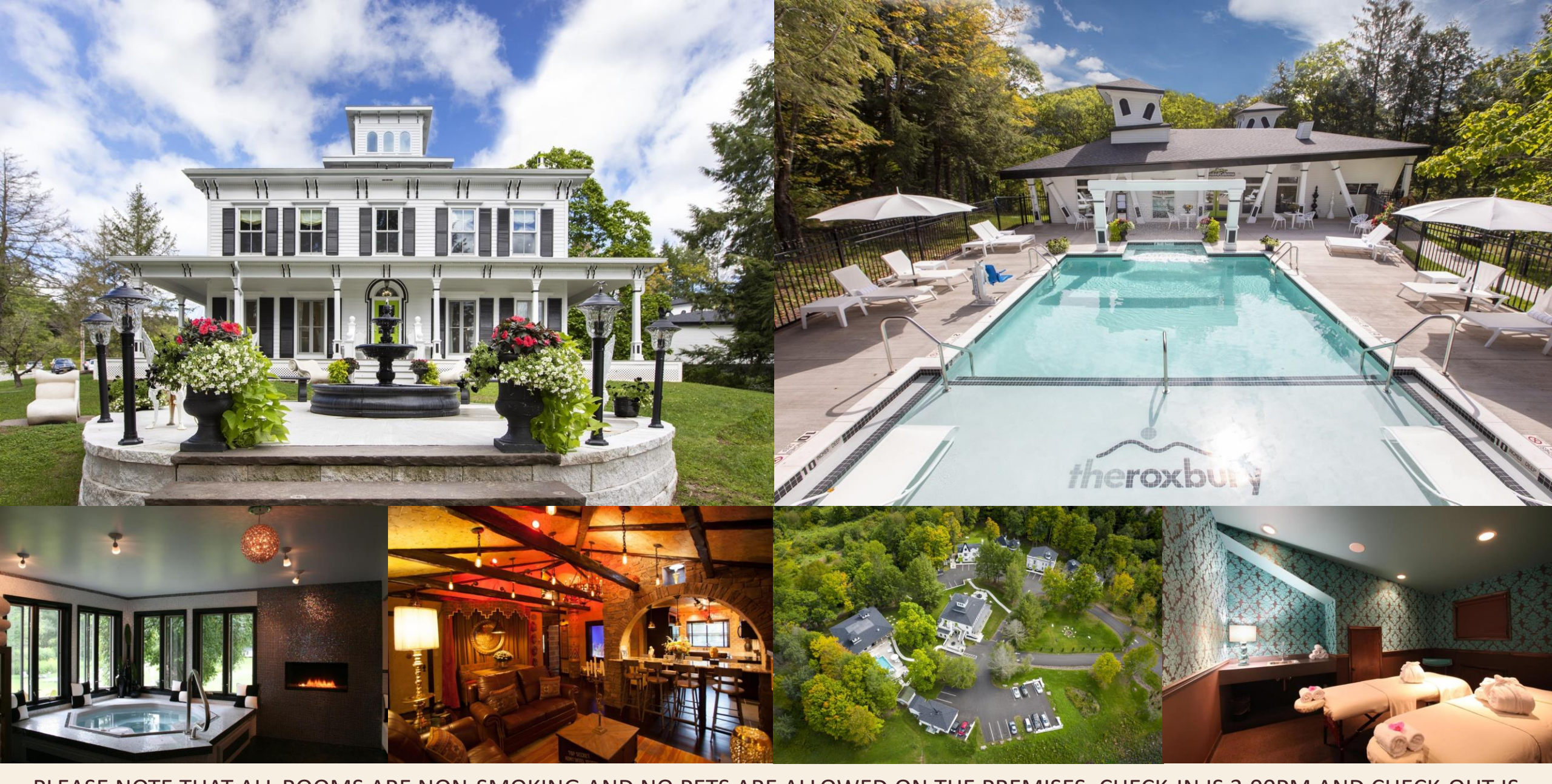
PLEASE NOTE THAT ALL ROOMS ARE NON-SMOKING AND NO PETS ARE ALLOWED ON THE PREMISES. CHECK-IN IS 3:00PM AND CHECK-OUT IS 11:00AM. THE FRONT OFFICE CLOSES AT 8:00PM, SO IF YOU PLAN TO ARRIVE AFTER 8:00PM, COME TO THE FRONT OFFICE DOOR AND YOU WILL FIND INSTRUCTIONS ON HOW TO GET TO YOUR ROOM.