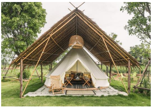
Jumtla Campiness Resort