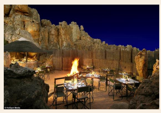
DINE UNDER THE STARS

For more great Theme Dream ideas visit us at www.gvcpoints.com