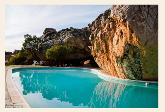
ON SITE AMENITIES