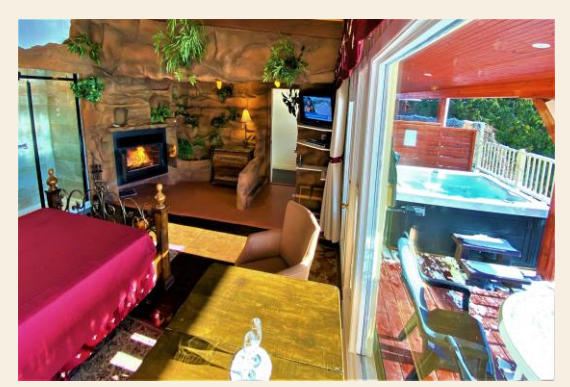
ROMEO & JULIET